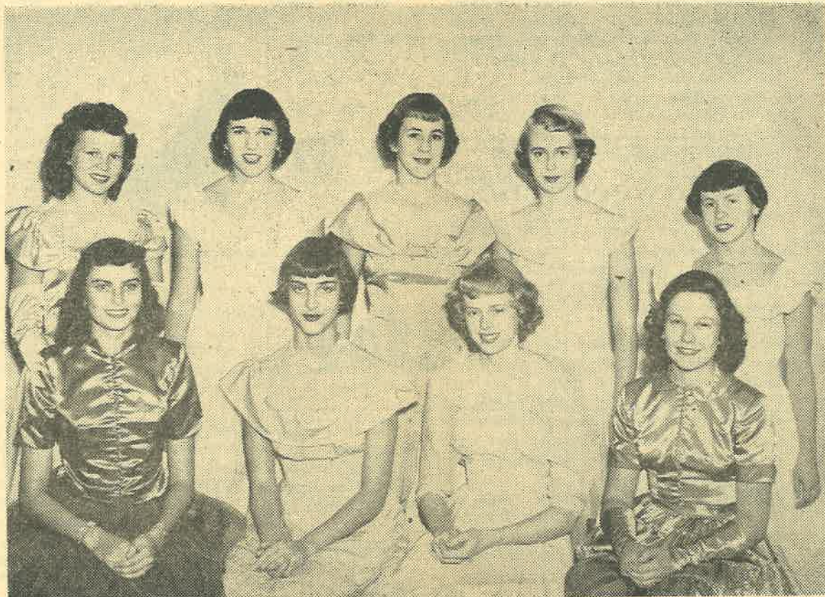
Pictured above are the Homecoming queen and attendants: