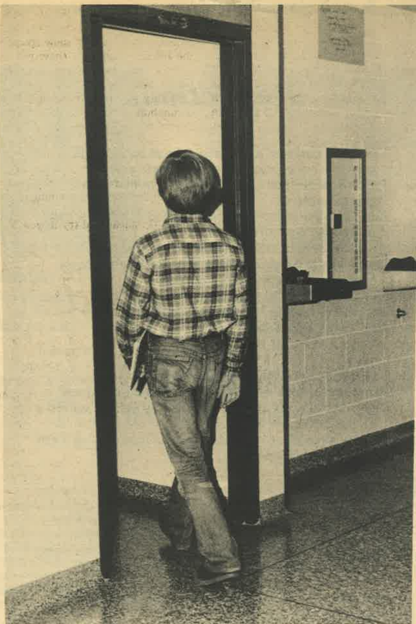
A problem confronting some unknowing sophomores during their adjustment to a senior high life style is unmarked women's lavatories.