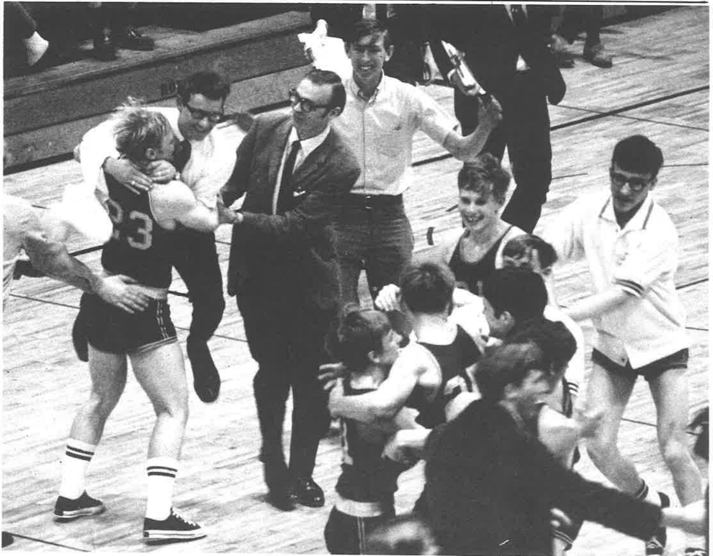
Hat's Off from NUHS to Gaylord for Going to the State Basketball Tourney!

The meet was for freshman in up novice, intermediate, and advanced categories.