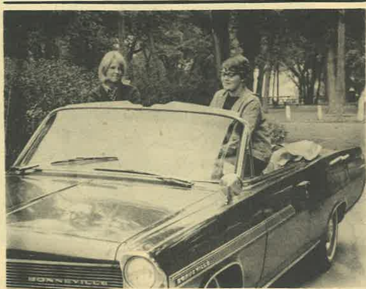
Graphos Editors pose on top of the Graphos press car.

In Italy they saw the opera, Aida, the Baths of Caracalla, and Naples. They returned home August 20.