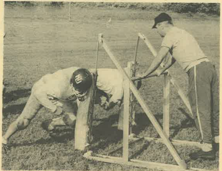
Coach assists Griders with football techniques.

With the help of the captains, coaches, and the rest of the team we are likely to have a profitable football season.