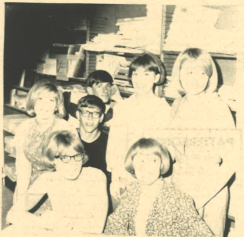
GET YOUR TICKETS HERE!