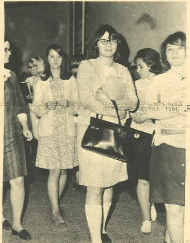
CROWDED HALLS ----- --UGH!

These pictures represent scenes that junior high students will never see when they enter senior high. Since we are moving into the new school next year, the editors thought you might enjoy a few laughs. If you see a friend in these pictures why not have him autograph it?