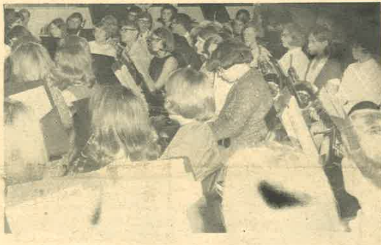
MUSICAL GROUPS SUFFERED UNDERGROUND