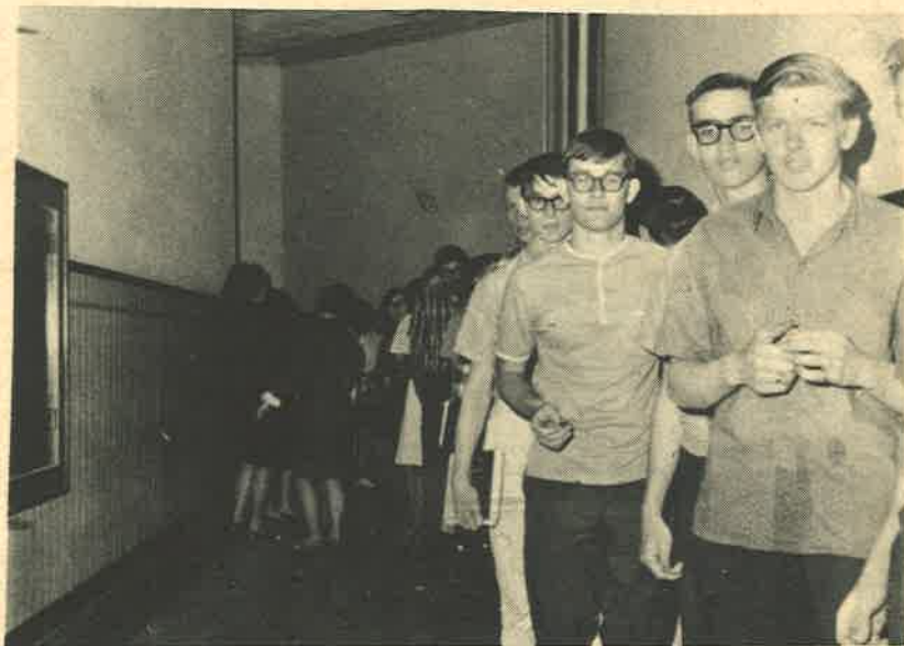
THOSE LOOOOONG LUNCHLINES