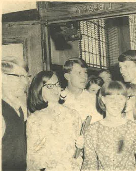
THOSE CROWDED LIBRARY STUDY HALLS