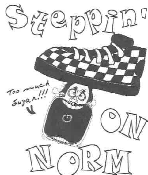
The official logo of the Band Steppin' on Norm, formerly known as The Vedas.