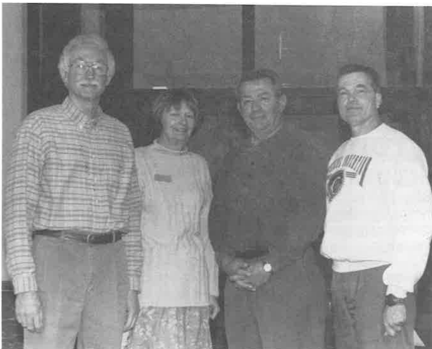
New Ulm High School says goodbye to the four retiring teachers.