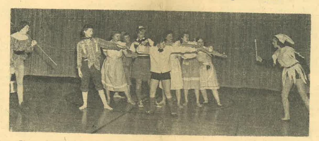
Pictured above is a group of senior girls who presented the modern dance 'Simple Simon' in the Modern Dance Assembly Program, February 16.