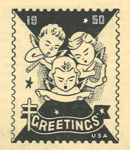
Buy Christmas Seals

if they're good looking, 10%—of course not. Well, enuff stuff for now. Here's wishing you all a Happy Christmas and a Merry New Year, and bon voyage to you kids Mexico bound.