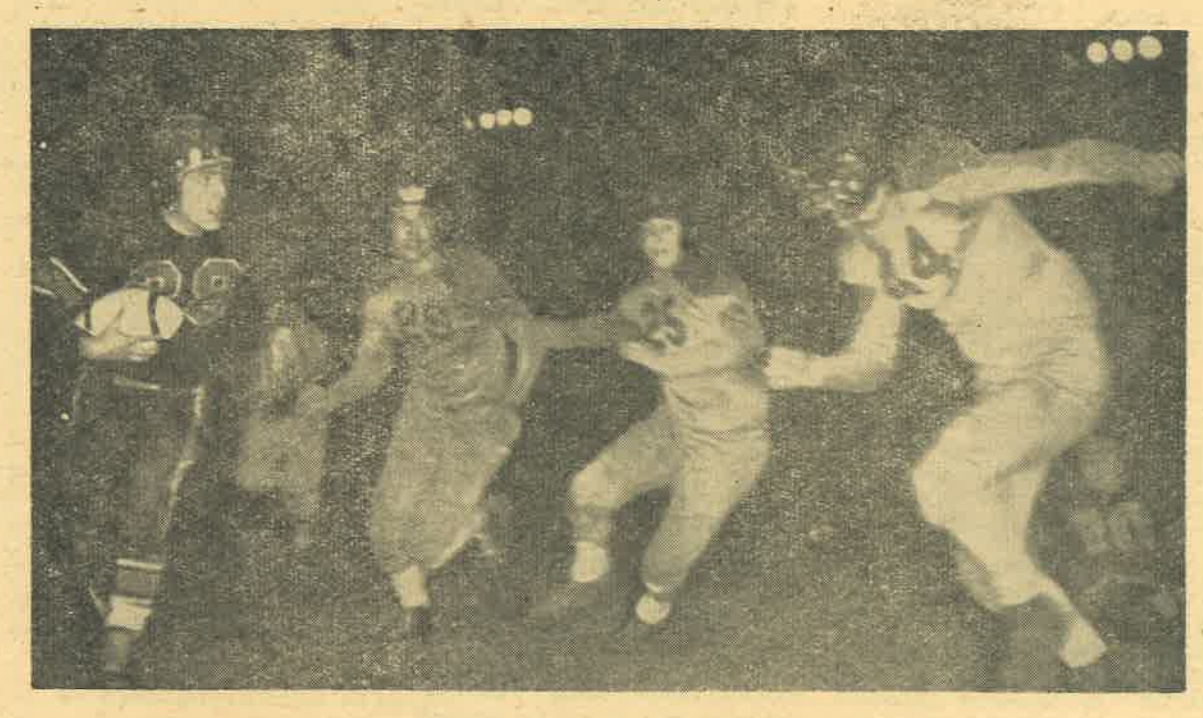
1949 Eagle Roster