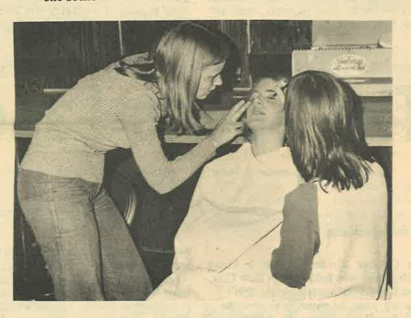
A member of the cast gets prettied-up before a dress rehearsal.

In all, the total impression of The Miracle Worker was of a play well worth viewing and remembering.