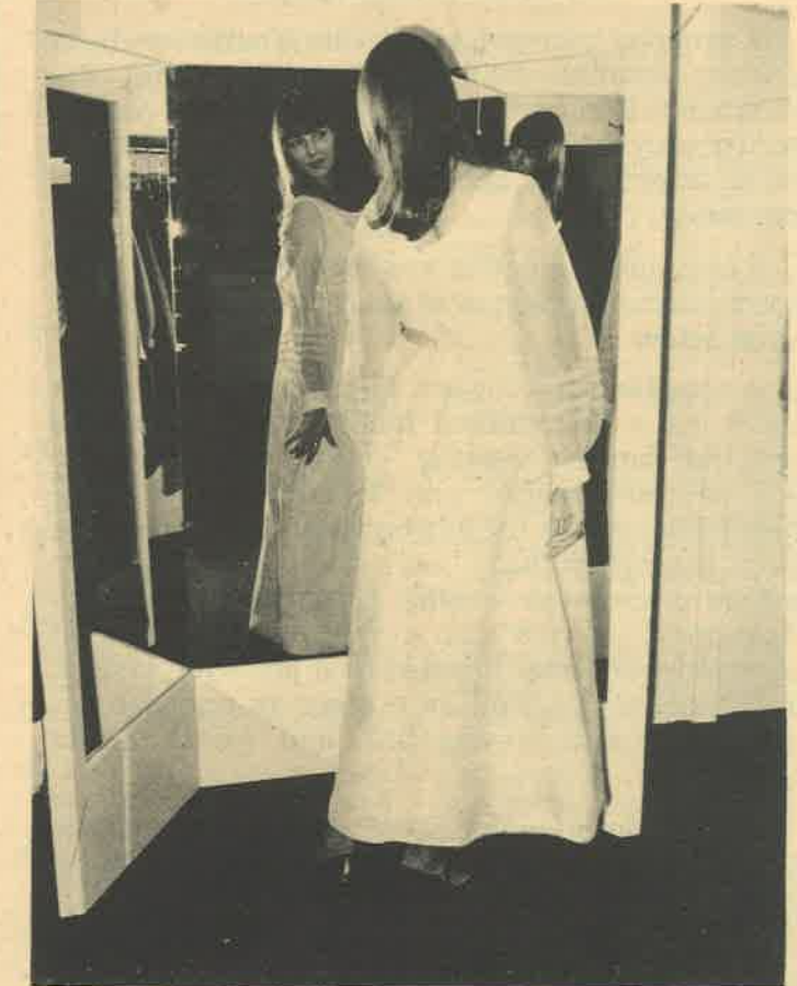
HOW MANY girls went through this same thing looking for the perfect dress? But it was worth it, wasn't it?

What we all should do, is to go out and live dangerously! By this I mean, catch the disease. Love a little, so you can really live a little. If everyone put just a little bit love in their lives, the world would be a better place.