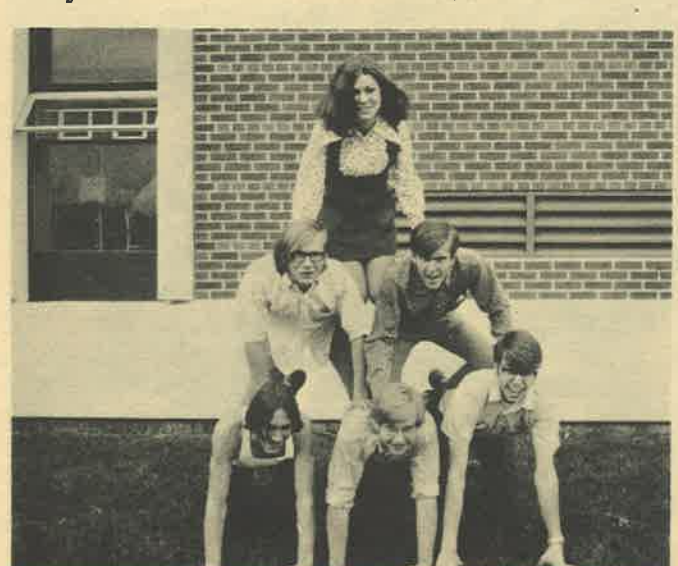
IT'S SPRING time. Time for planting, flunking, hoeing, raking, and pyramid building.

Friday, May 22, 1970 New Ulm Senior High School Vol. 52, No. 10