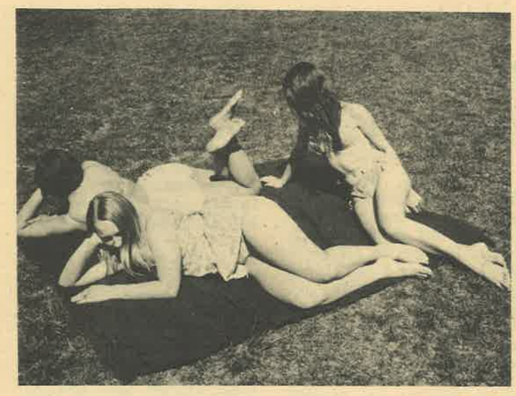
SKIN is in.