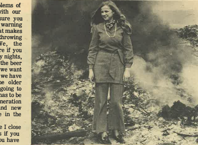
AND THEY call this trash?