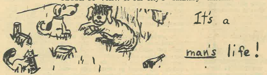
CLOSE-UP VIEW of our city's "sanitary" landfill.