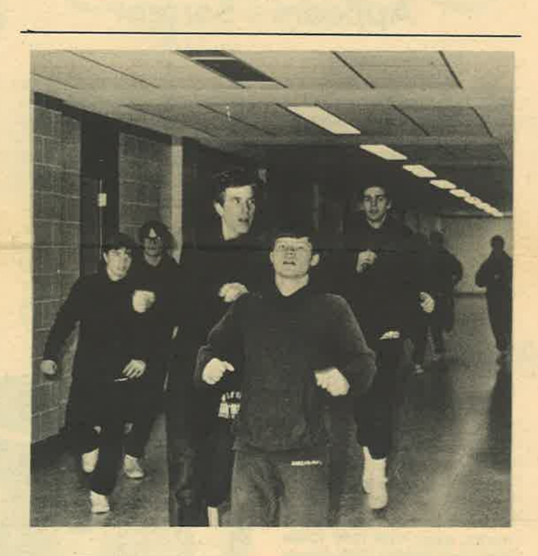
WOULD you believe they are late for classes?