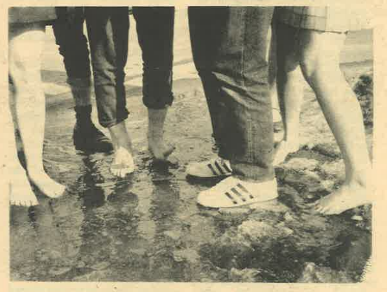
WALKING in a winter wonderland.

Taking it like a true heap winner, the feet haven't done a bit of boasting, up till now. SOCK IT AWAY!