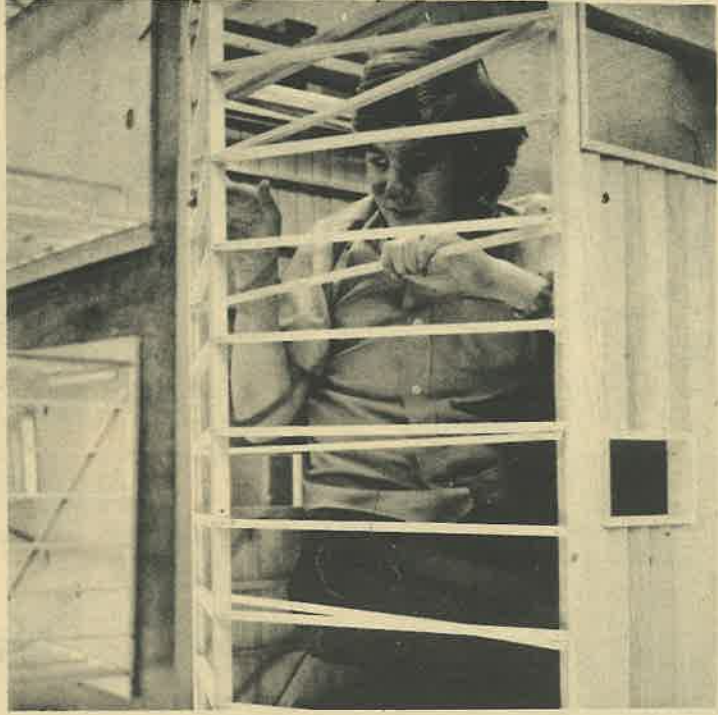
THAT'S a bird in a gilded cage.

All in all, next year should being fewer problems to the administration than ever before. With no required attendence, no grades, no dress code, and no rules, why bother coming?