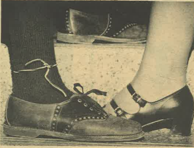
Should we be meeting like this?!