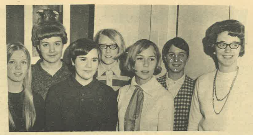
"Did you say Ach ya?" "No, Ole!"

Our star salesman is a broadminded fellow-just ask any of the secretaries.