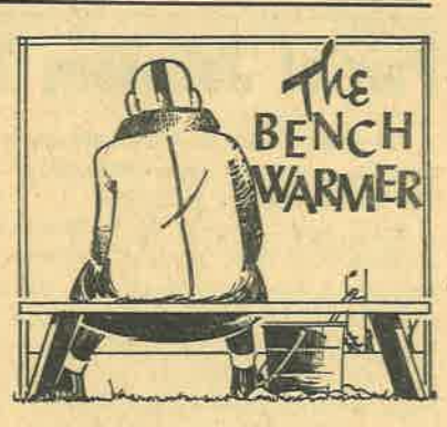
By Butch Burnett

There is nothing just as good' as GENERAL ELECTRIC