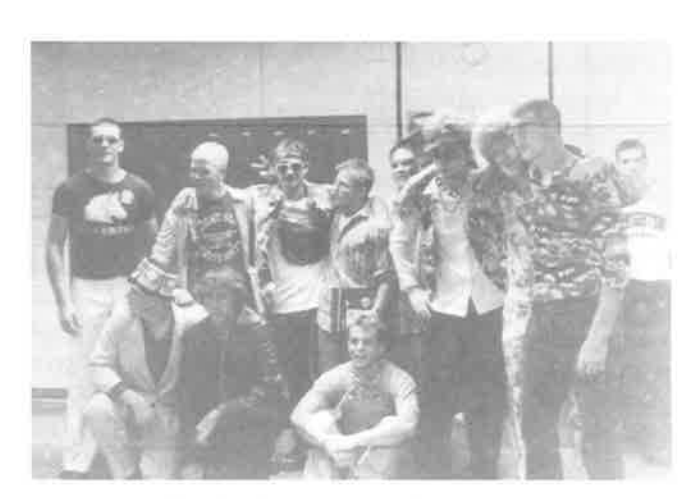
A group of hip looking guys go all out on retro day during Homecoming Week.