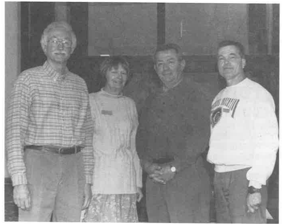
New Ulm High School says goodbye to the four retiring teachers.

numerous tasks in his years or teaching.