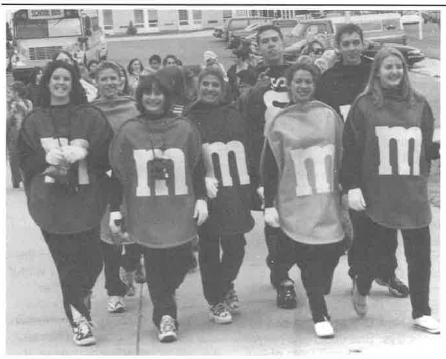
These juniors dressed as M&M's, along with other students in costumes, return to the high school after visiting the students at Jefferson.