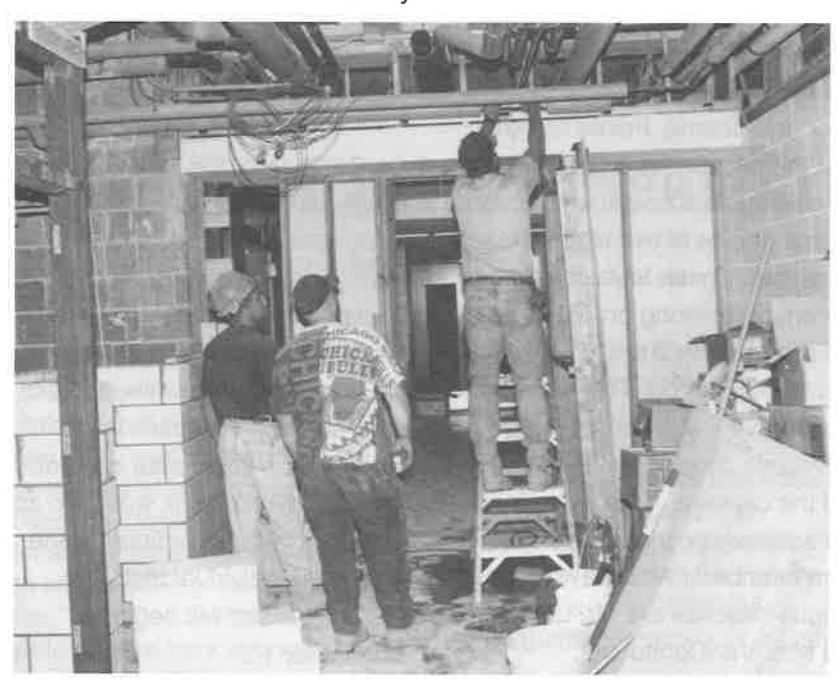
Construction is still in progress from the last referendum. The science lab remodeling is complete and students are now able to have classes there.

Although you will never see a dime of the $146 that is dedicated to your education, the money is used to help educate you. While most of us wouldn't mind having another $146 in our pockets, the money is probably better spent by the school system. $146 worth of clothes or cd's won't prepare you for your future as much as textbooks, teachers, activities, and computers could. Among other things, the school system uses the money to keep the class sizes small, keep classes and extra curricular activities from being cut, and improving the technology in the school. In short, the increased funding will help everyone in one way or another, except the graduating seniors who will not be here to receive the benefits of the additional money.