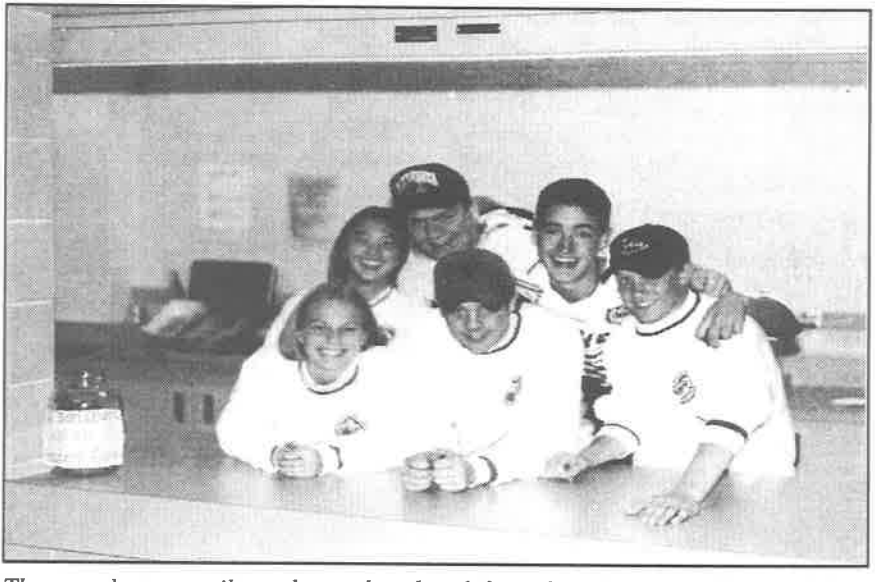
These student council members take a break from the grind to pose for a quick snapshot. The students have been spending some time getting accustomed to their new permanent home.

The new concession stand was slated to be completely finished by November first, barring any unusual complications, and providing the student council members don't try to burn it down. While the new stand is not quite up and running, the grand opening will arrive any time. Burnt popcorn or not, congratulations and good luck to the student council members on getting this going.