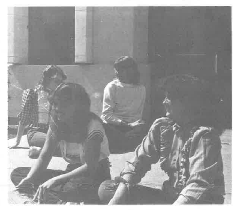
Juniors and seniors enjoy their last days of school.