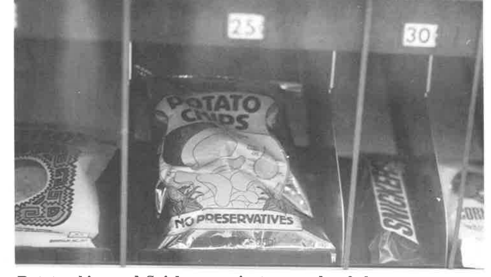
Potato chips and Snickers are just a couple of the many courses served up in the Senior Lounge.

When the junk food "junkie" reaches the Senior High, he has become a hardcore consumer. During school he is allowed to supply his habit three times a day by rushing to the Paper Mache before school, during lunch, and after school. If the hardcore is having withdrawal pains during a time when the Paper Mache is not open, he will usually beg the nearest senior to supply him from the "Junk Food Heaven," The Senior Lounge as it is called by some people. When the "junkie" becomes a senior, it is almost as good as owning his junk food store. Whenever a senior gets junk food withdrawal, which is close to every fifty minutes, all he needs to do is run down to "The Junk Food Heaven" and deposit his coins in one of five machines and push a button. Becoming a senior with access to "The Junk Food Heaven" is known as a hardcore junk food junkie. However, the junkie must avoid his worst enemy, some nutritionist who has tried to contaminate "The Junk