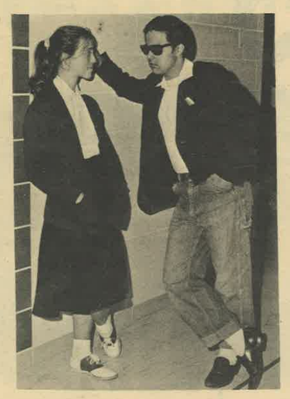
Loafers Larry backs up a rosy-cheeked Barbara Ann against the wall to ask her out to the Greasy Spoon.

Big Shot Shermann has neat, round patches on the elbows of his sweater because he's always cooly leaning against the wall, impressing Saddle Shoe Suzy, who is dressed in a wild, knee-length pleated skirt, white blouse, and anklets. Suzy has absolutely been going ape because it's chilly and she can't seem to get Big Shot Sherman's sweater. She swiftly pulls out a powder compact, smartly snaps it open, and puts on a seventh layer of ruby red lipstick. Then