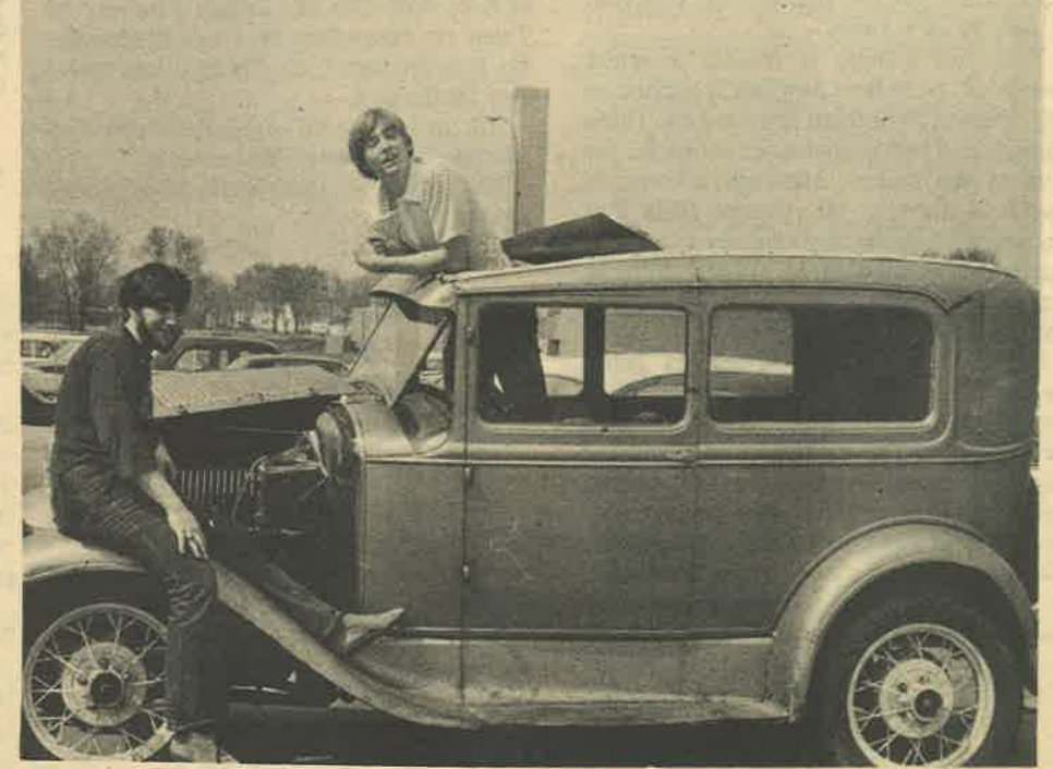
Ralph Wieben and Jeff Lohman are shown here looking at Ralph's Model A's fine engine.